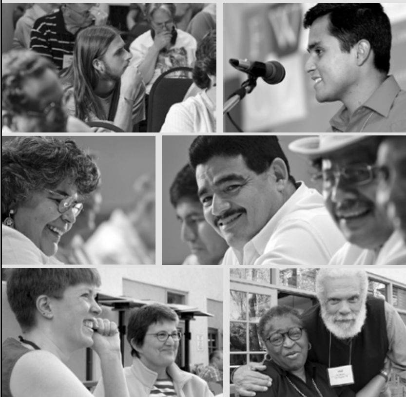
Local Arrangements Committee

From a first-time attendee at the 2005 Annual Meeting in Tempe, Arizona